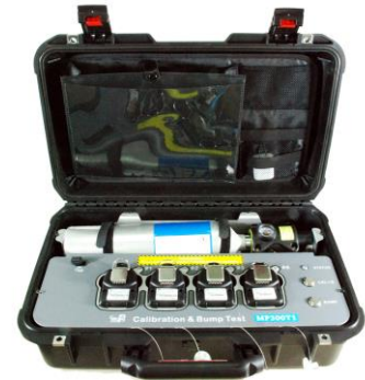
CaliCase Docking Station