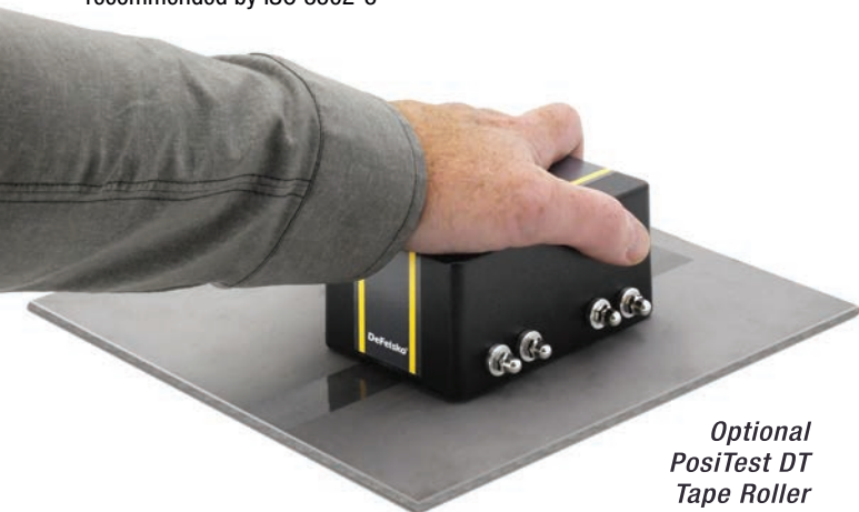
Optional PosiTest DT Tape Roller

Conforms to ISO 8502-3, AS 3894.6, US Navy PPI 63101-000