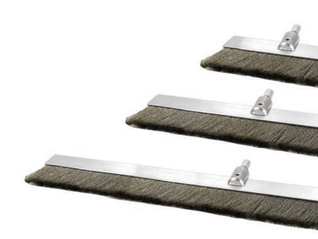
Flat Wire Brush Electrodes