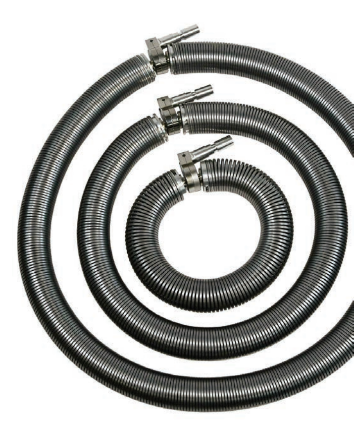
Rolling Spring Electrodes