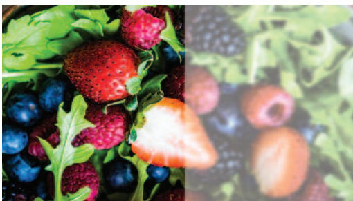
Viewed through material with low haze